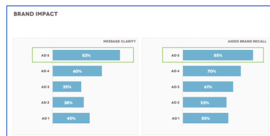
Figure 2: Scores of all 5 ads on brand impact dimensions in print ads