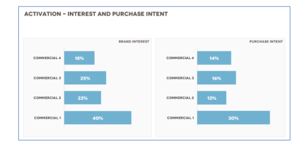
Figure 2: Commercial 1 outperforms other commercials on interest and purchase intent