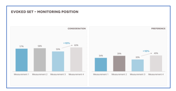
Figure 1: Distinctiveness scores for each measurement